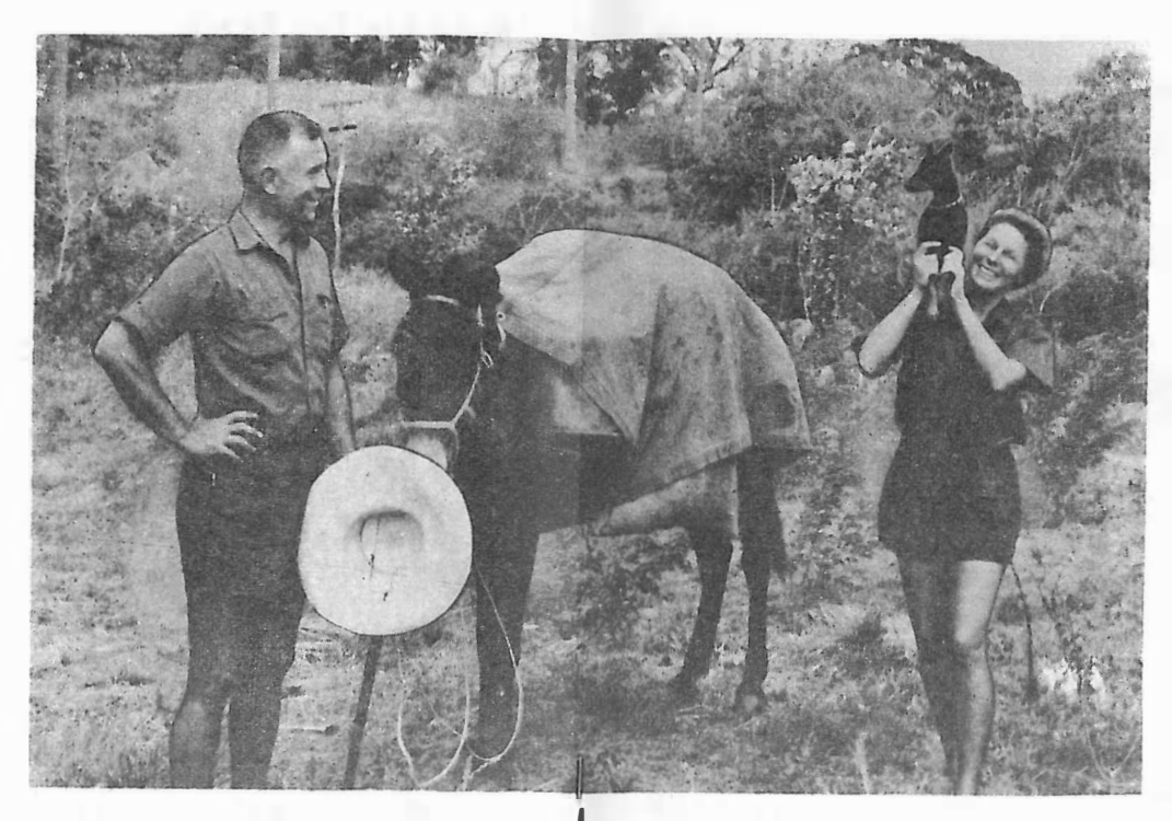
HARDY TEXANS WHO TREKKED ON UNUSUAL NATURE HIKE.

Two years ago they were married, started to share childhood dreams of jungle hiking absolutely away from it all. Then came planning, finally preparations to start on one of the most unique trips ever made on foot.